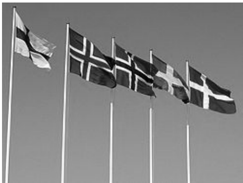
Finland, Iceland, Norway, Sweden, Denmark