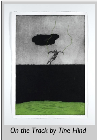
On the Track by Tine Hind

Otterbein College will host an exhibit of prints from sister city Odense, Denmark from June 14 through July 20 at the Fisher Gallery in Roush Hall. The exhibit is entitled IMMIGRANTS and will feature graphic images from the Funen Graphic Workshop located in sister city Odense, Denmark.