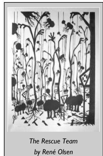
The Rescue Team by René Olsen

Transportation of the exhibit from Denmark and within the United States has been generously provided by Leman USA.