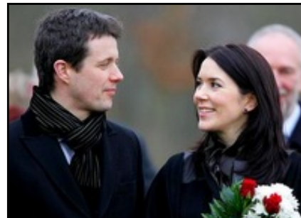
Denmark's Crown Prince Frederik & Crown Princess Mary

Celebrating Valentine's Day in Finland is a very young, but also very popular tradition. Despite the fact that Finland has celebrated Valentine's Day only since the 1980s, it's now a beloved annual event. There are dedicated dances and events. Finns call Valentine's Day "Ystävänpäivä," literally meaning "Day of Friendship."